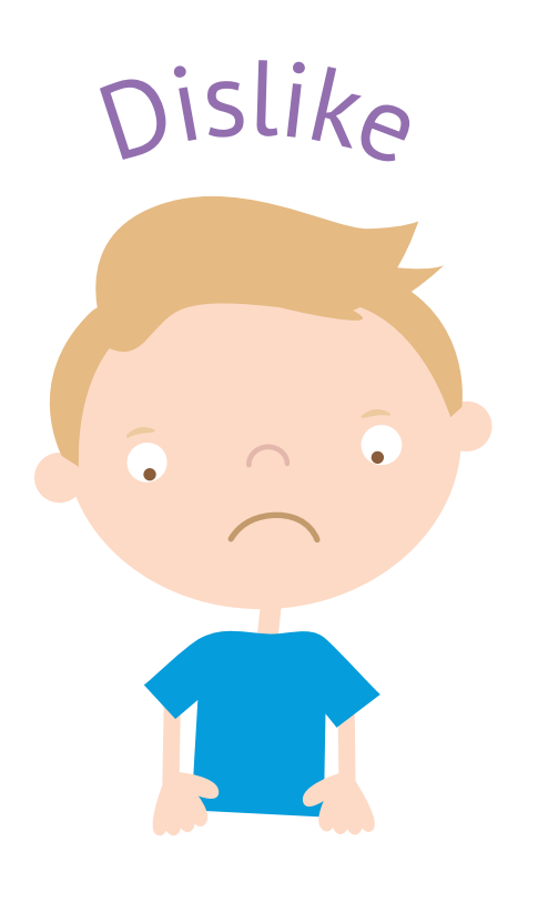
artwork ©2015 Utah Dual Language Immersion